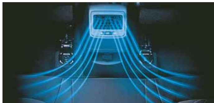
Rear AC Vent & Accessory Socket