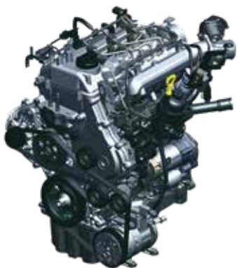
Bigger | Powerful 1.2l U2 CRDi Diesel Engine