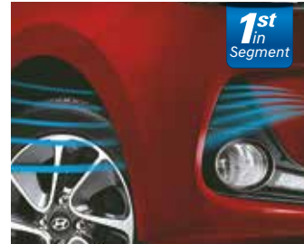
Front Air Curtains