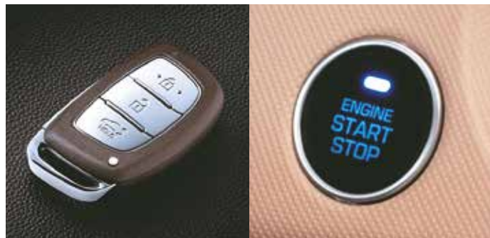
Smart Key with Push Button Start-Stop