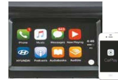
Apple CarPlay Connectivity