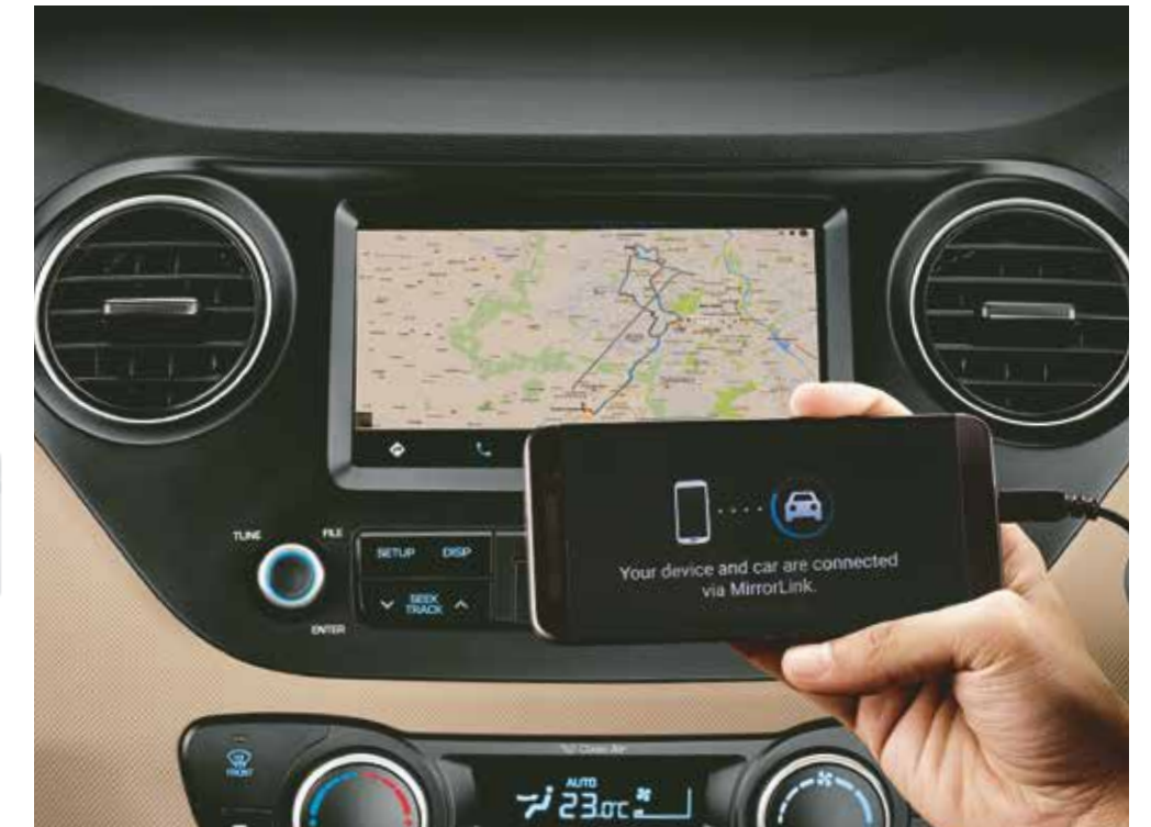
Mirror Link | Smart Phone Navigation

The GRAND i10 offers assistive technology at its very best with a class-leading 17.64 cm Touch Screen Audio Video System with smartphone connectivity, voice recognition and navigation support.