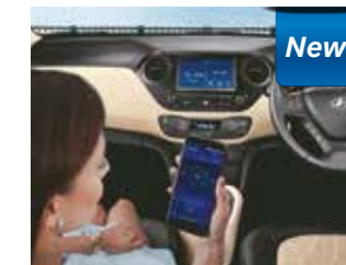
Hyundai iBlue Smart Phone App for Audio Remote Control*