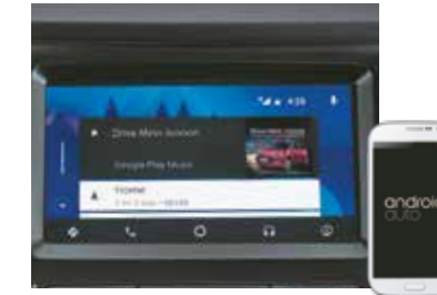
Android Auto Connectivity