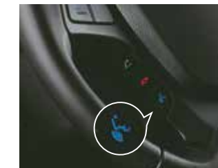
Voice Recognition Button on Steering