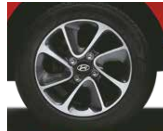
Diamond-cut Alloy Wheels