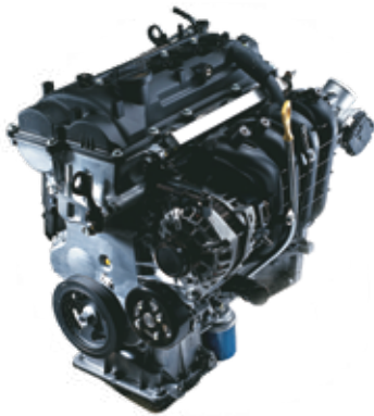
1.2l Kappa Dual VTVT Petrol Engine