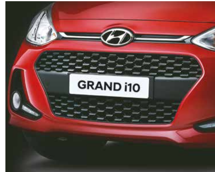
Cascade Design Grille - Bold New Design Identity