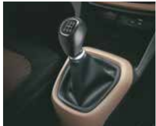
5-speed Manual Transmission

Experience power like never before with the state-of-the-art petrol and diesel engines of the GRAND i10.