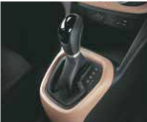
4-speed Automatic Transmission