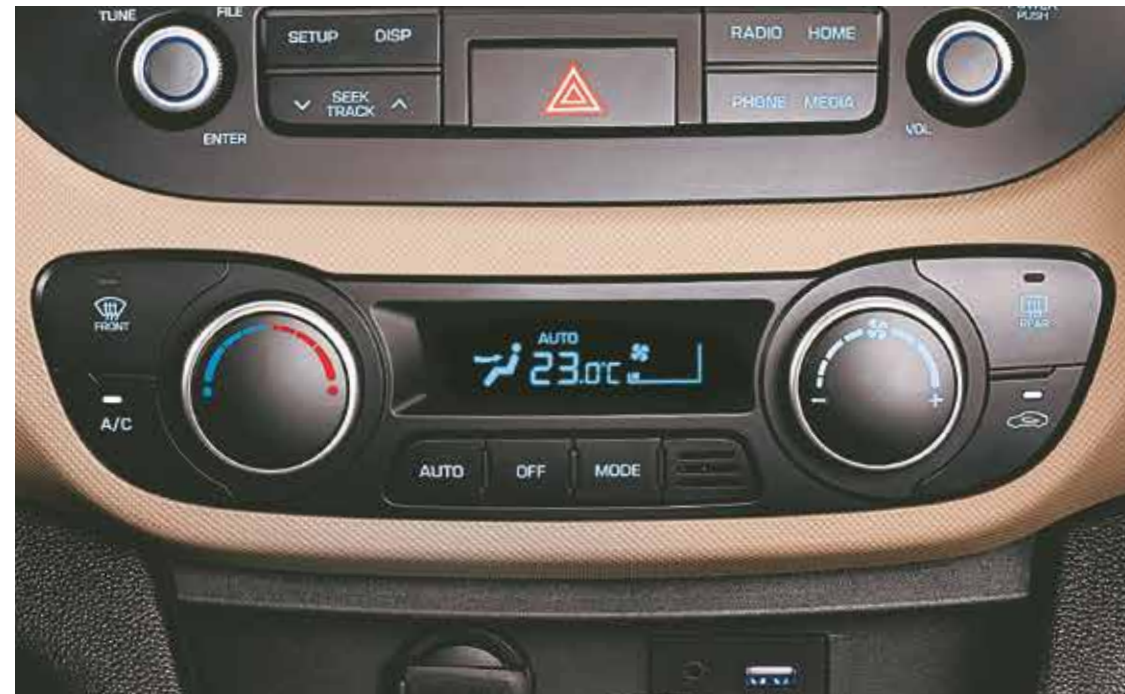
Fully Automatic Temperature Control