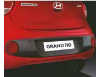
Dual Tone Rear Bumper