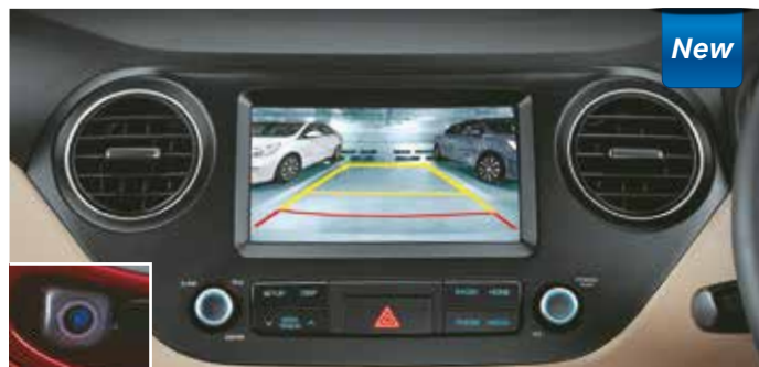
Rear Parking Assist System (with display on 17.64 cm Audio Screen)