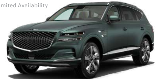
BRUNSWICK GREEN MATTE Limited Availability