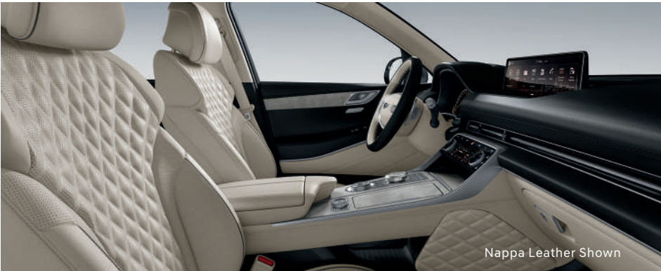
BLACK/BEIGE WITH METALLIC POREFILLER ASH WOOD TRIM