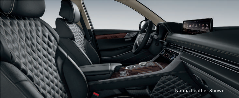
BLACK/BLACK WITH OLIVE ASH WOOD TRIM