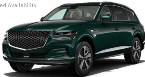
CARDIFF GREEN Limited Availability