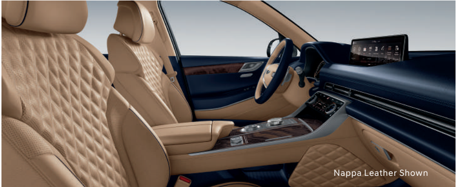
ULTRAMARINE BLUE/DUNE WITH OLIVE ASH WOOD TRIM