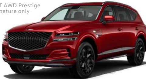
MAUNA RED 3.5T AWD Prestige Signature only