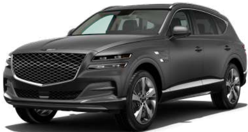
MAKALU GRAY MATTE